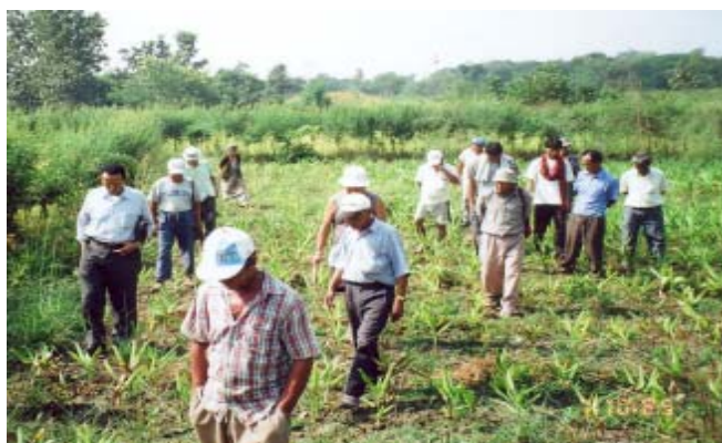
All farmers visits Demo Farm Norgyaling, Bandara