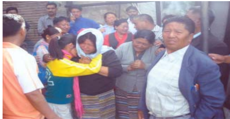
Settlement officer consoling the grieving shop owners

Around 20 Tibetan shops at Gol Market, Ladakh were completely burnt down with all its goods during untoward fire incident on the night of 25th July 2007. The Chief Representative of Ladakh, Central Tibetan Administration immediately rushed to the site and asses the scale of damages with Chairman of Local Tibetan Assembly, Director of TCV School, Ladakh and President of Tibetan Freedom Movement of Ladakh. They personally meet with shop owners to console them and immediately agreed upon consolation Rs. 7500/- for each shops. The amount were release from Chief Representative Office, Ladakh in advance and further the 13 members of special committee were set up for the reconstruction and restoration of market.