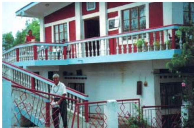
Angel’s Home, Lugsum Bylakuppe