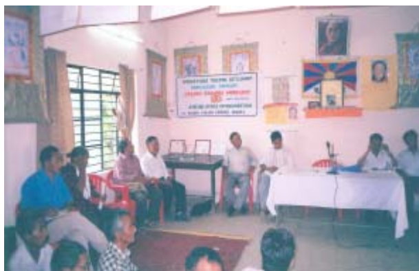
Organic Farming Workshop on System of Rice Intensitication, Bandara